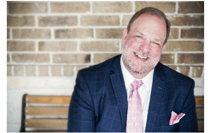
Guy Keith Rodgers